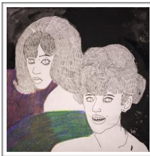
(Three untitled art pieces by Noelle Putnik)