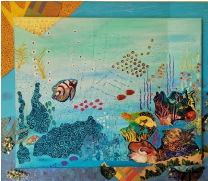
Treasures beneath the Sea

(Editor’s note: See two of Phyllis’s beautiful works below and don’t forget to read The Pen Woman magazine. There are several categories that take submissions.)