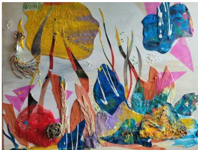
Under the beautiful Sea