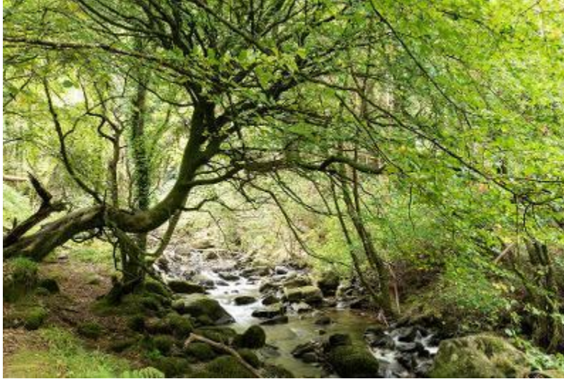
Tree and Stream