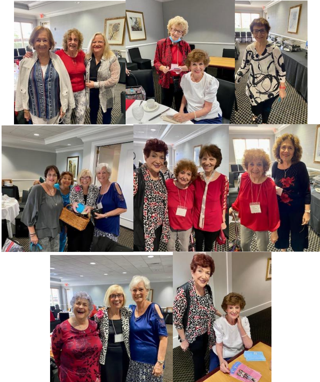
(Photos from our March 8 th Luncheon will be included in the April 10 th Pen and Palette)