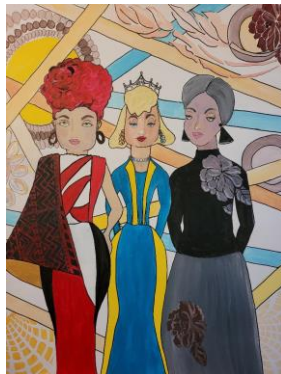
Acrylic on canvas, 24" across by 30" down

My fiber journey, quilting, continues to enchant me. Some of you may remember my presentation of quilts and paintings that have quilting styles within them. I loved doing that workshop. My newest piece is called, A Million Pieces of Love . It is a crazy quilt made for my daughter-in-law whom I adore. It is entered in the juried Quilting Exhibition at the Charles F. Dodge City Center, 601 City Center Way, Pembroke Pines. Florida. The show is a brief two-day event on April 15 th and 16 th . There were over 260 quilts entered. Please try to come and see the world of amazing quilts. You won't believe the art and skills that are involved!