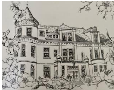
Pen Arts Building © in Washington D.C. Drawing by Member Prue Carrico

Founded in 1897 NLAPW Headquarters The Historic Pen Arts Building