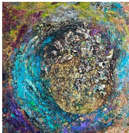
Pot of Gold