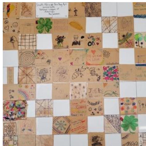
Tea Bag Art

Please let us know of any contests our artists might like to enter. Some of you are involved in different groups that would be open to our art members joining. Most importantly, we would enjoy supporting you by going to see your art. Some events have already occurred, and we were unaware of them. Please let us support each other. That's how we grow, become friends, and expand our world.